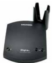
Digta Soundbox 830