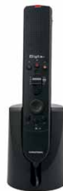
Desktop dictation: Digta SonicMic II