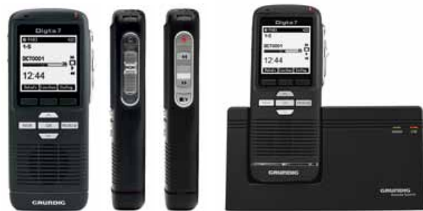
Mobile dictation: Digta 7