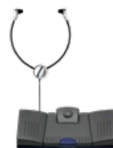
Compatible with existing foot control and headsets from Grundig Business Systems

www.grundig-gbs.com · info@grundig-gbs.com · Infoline: +49(0) 911-47 58-4