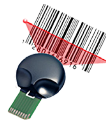
... and scan.