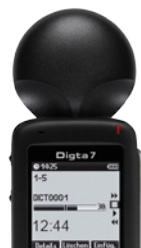
Just plug it in...